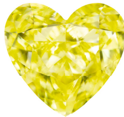
Fancy Intense Yellow