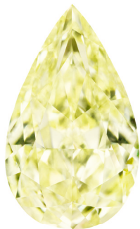
Fancy Light Yellow